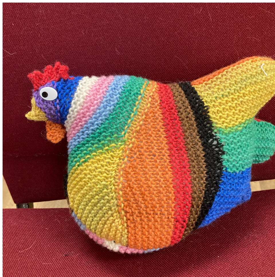
Progress Pride Emotional Support Chicken

Rik's E-Book " The Magic (and Science) of Double Knitting " is now available via Ravelry or our online store . It is presently only available as a digital download, but we hope to have printed copies available in future. We do sell many kits of designs that are in the book. Most of the patterns now have a page on Ravelry so please link and share your project if you've made one of Rik's Double-Knits!